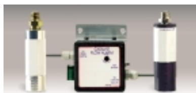
The Catalyst Flow Alarm will alert an operator to any change in catalyst or resin flow at virtually any flow rate.